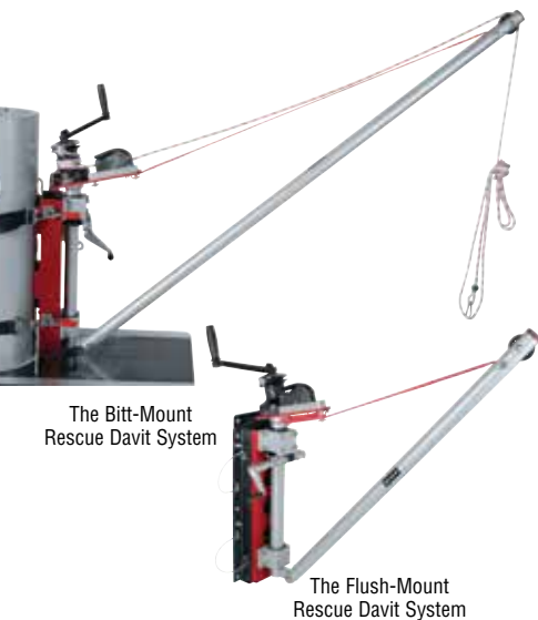
The Bitt-Mount Rescue Davit System

Complete either system with the VR 12 Rescue Pole, sold separately.