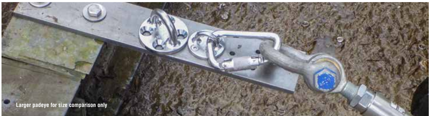
Larger padeye for size comparison only